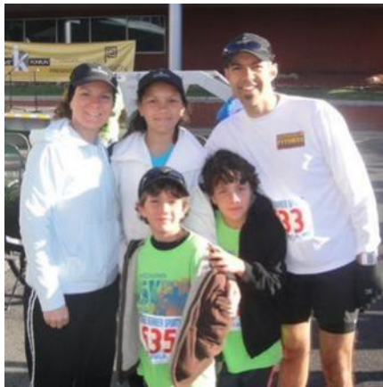
The Kitchen Run 5K May 8, 2010

So, rally cap in place, we started the process to return. Physically, it meant going through physical therapy and dedicating myself to nutrition, making sure that my tank was full of the fuel I needed to power the comeback. After months of rehab and baby steps in my return to running, I finally had a breakthrough—a personal record in the Kitchen Run 5K this May.