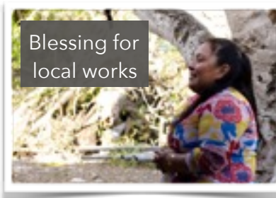
Blessing for local works

Recently, we've come to find that this gift has freed up resources to help establish places of worship in strategic cities. Check out our website to find out more: http://goo.gl/JNrQKa