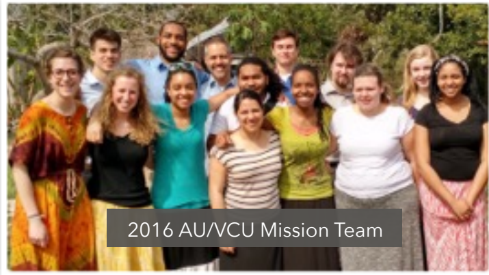
2016 AU/VCU Mission Team

But these Chi Alpha teams are valuable for more than their strong backs and servants' hearts. They serve as catalysts for new and continuing ministry.