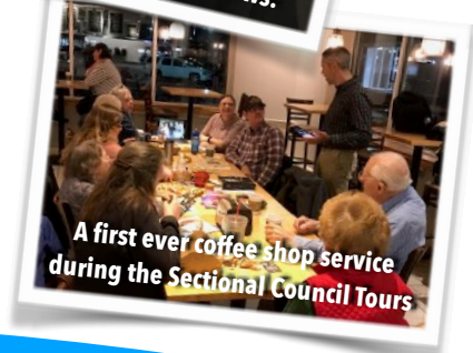
A first ever coffee shop service during the Sectional Council Tours